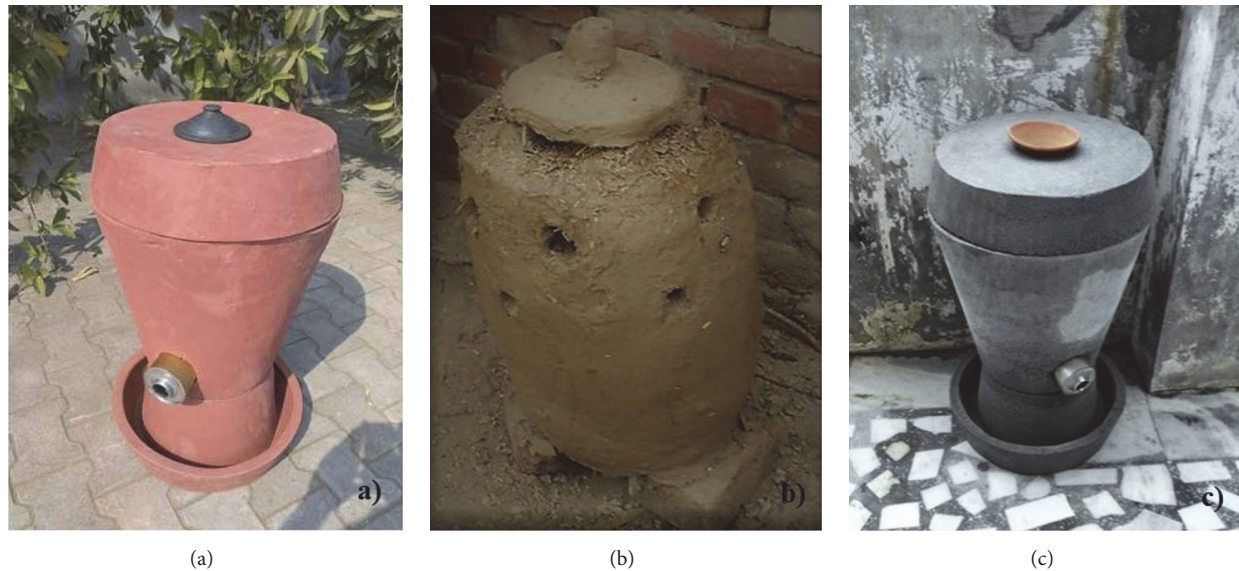
FIGURE 4: Incinerators used to dispose of menstrual waste in rural areas of India: (a) clay incinerator ( http://www.ecoideaz.com/innovative-green-ideas/ashudhinashak-clay-incinerators-for-sanitary-napkins ); (b) mud incinerator ( https://www.thebetterindia.com/87876/master-art-deal-with-menstrual-waste/ ); (c) cement incinerator ( http://www.ecoideaz.com/innovative-green-ideas/ashudhinashak-clay-incinerators-for-sanitary-napkins ).