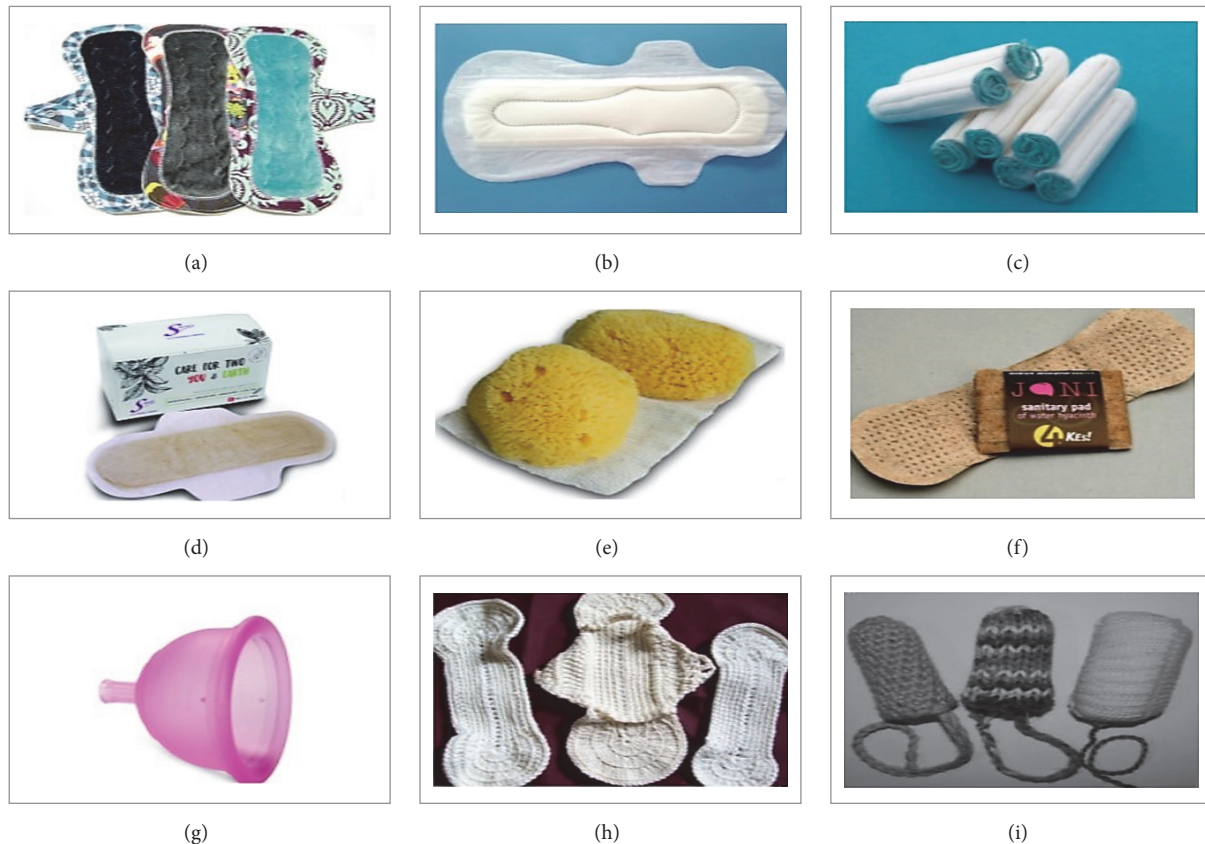
FIGURE 1: Types of sanitary products used by women during menstruation are (a) reusable cloth pads ( https://www.etsy.com/market/cloth-menstrual_pads ); (b) commercial sanitary pads ( http://topyaps.com/things-girl-must-know-about-sanitary-pads ); (c) tampons ( http://www.womensvoices.org/tag/tampons/ ); (d) pads made from banana fibre ( https://saathipads.com/ ); (e) sea sponges used as sanitary material ( https://www.pinterest.com/pin/194640015120225878/ ); (f) pads made up of water hyacinth ( https://www.ecouterre.com/jani-a-biodegradable-sanitary-napkin-made-from-water-hyacinth/ ); (g) menstrual cup ( http://rubycup.com/blog/how-to-clean-the-suction-holes-of-your-menstrual-cup/ ); (h) pads made from wool ( https://www.pinterest.com/pin/198088083583361670/ ); (i) reusable tampons ( http://natural-parentsnetwork.com/reusable-menstrual-products/ ).

flow before it leaves the body. They are expensive, not easily degradable in nature and, hence, not very environmental friendly. Nowadays, sea sponge tampons are available in the market which are a natural alternative to synthetic tampons.