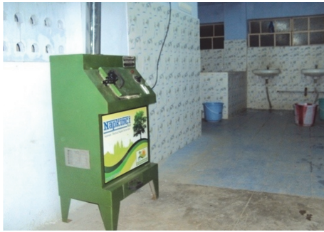
FIGURE 3: Incinerator installed in the toilet for easy sanitary products disposal.

have made for solid or biomedical wastes. Appropriate policy and legal framework is necessary for the management of menstrual wastes.